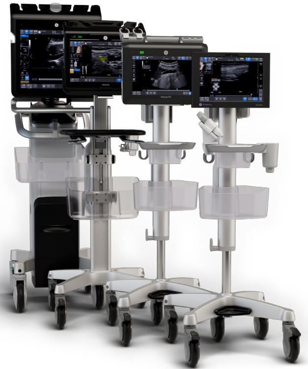
Venue™, Venue Go™, Venue Fit™, and Venue Sprint™